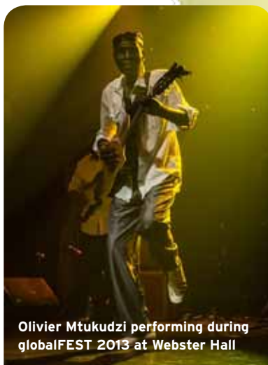
Olivier Mtukudzi performing during globalFEST 2013 at Webster Hall

The event's mission: to keep global music prominent. "Global-FEST was formed in the aftermath of 9/11 and during the lead-up to the Iraq war as a way to break down cultural barriers and support international performing in the U.S.," says