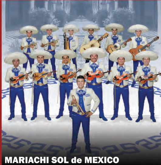
MARIACHI SOL de MEXICO