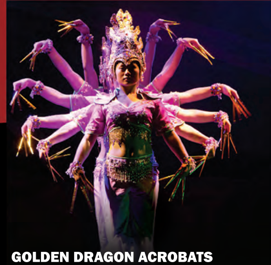
GOLDEN DRAGON ACROBATS