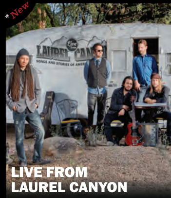
LIVE FROM LAUREL CANYON