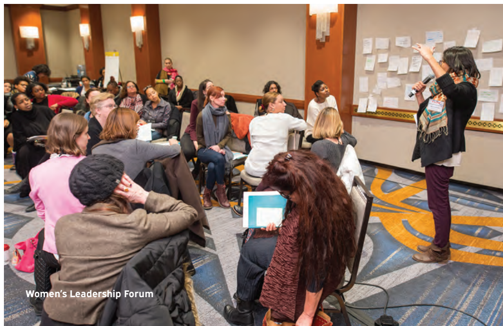
Women’s Leadership Forum