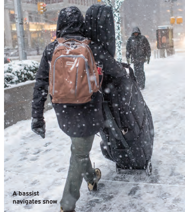
A bassist navigates snow

“Artists must tear apart our world to achieve change, but they must also weave it back together.”