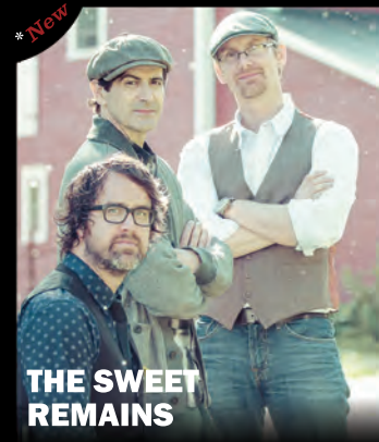
THE SWEET REMAINS