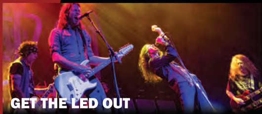
GET THE LED OUT