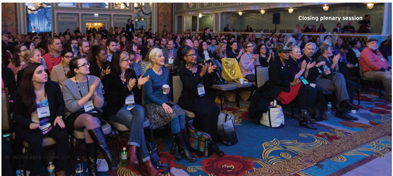
Closing plenary session

to form partnerships that would stretch across an ocean. The Sino-American Seminar , which was conducted in both English and Mandarin, showcased work that had blossomed in China and hoped to plant seeds in the U.S. and elsewhere. In response to feedback from previous iterations of the panel, the presentations have expanded to include private Chinese companies. In several cases, their work involved exciting new technologies. For example, The Three Body Problem