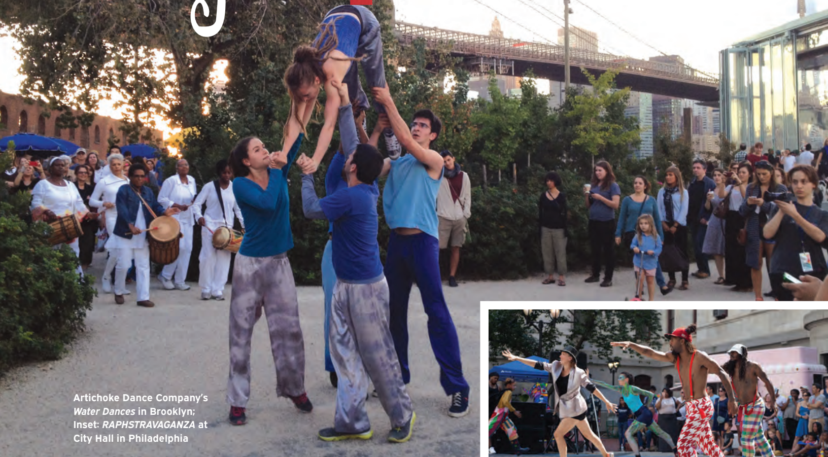
Artichoke Dance Company's Water Dances in Brooklyn; Inset: RAPHSTRAVAGANZA at City Hall in Philadelphia

Nontraditional venues spur creative teams and audiences to take a new approach for experiencing performance.