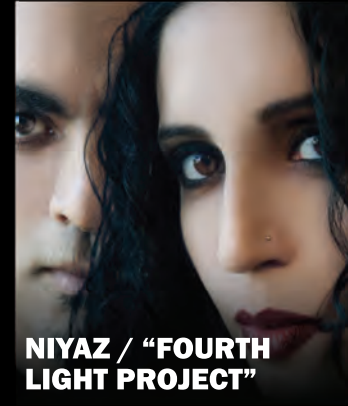
NIYAZ / "FOURTH LIGHT PROJECT"