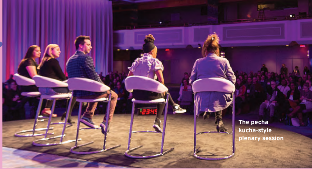
The pecha kucha-style plenary session