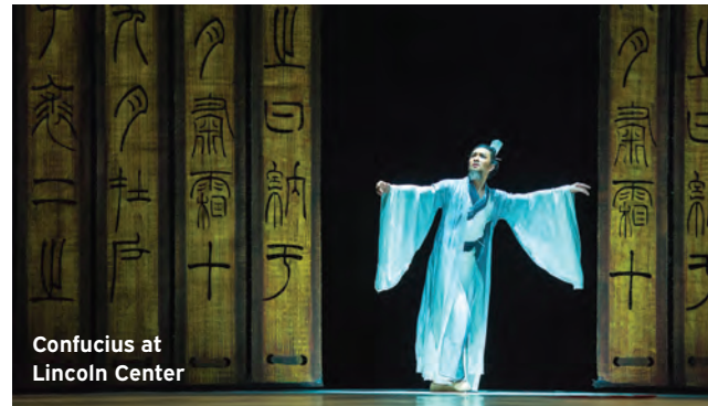
Confucius at Lincoln Center

experience. “The take-away here is the length of time it takes to build something like that, the patience. The process is just as important as the product in a work like that.”