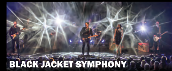
BLACK JACKET SYMPHONY