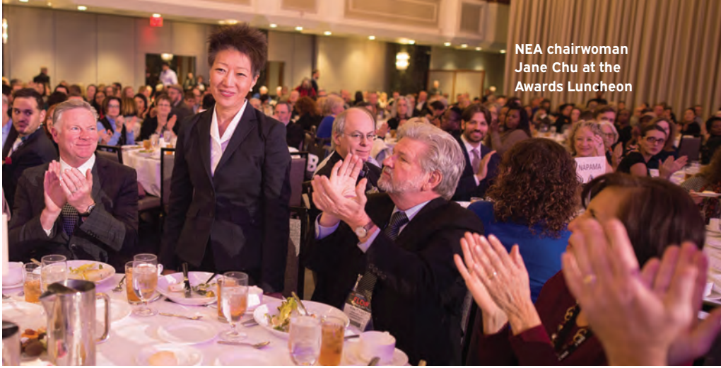
NEA chairwoman Jane Chu at the Awards Luncheon

boasts indoor flying drones and 3D that can be experienced without 3D glasses.